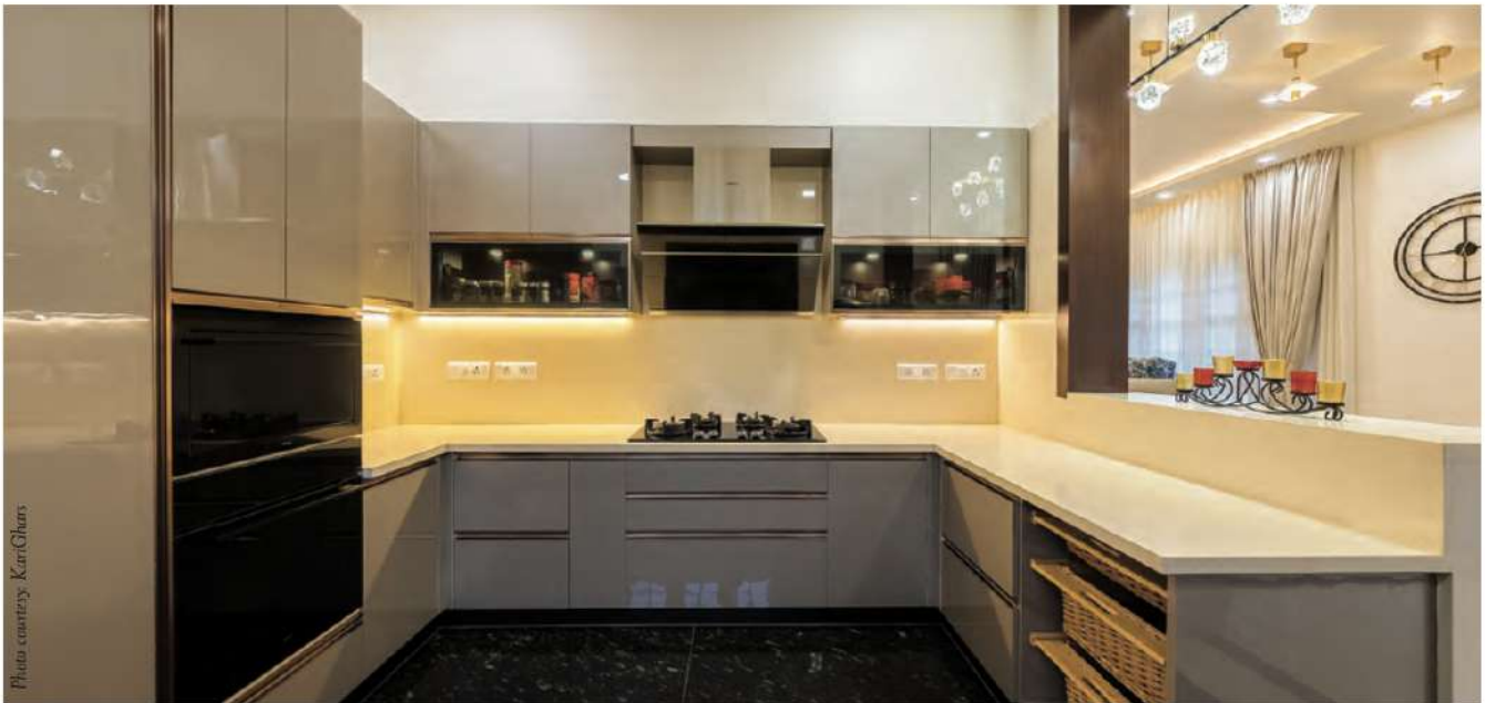
Acrylic can be chosen for durability or colourful polyurethane finishes can be incorporated to offer an elegant look.

maintenance can take a toll. If these are well chosen, the kitchen can last a lifetime."